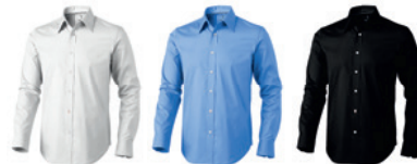
01 white 40 light blue 99 black