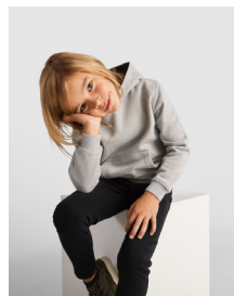
URBAN KIDS K1067