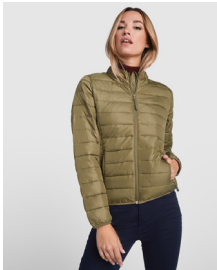
FINLAND WOMAN R5095